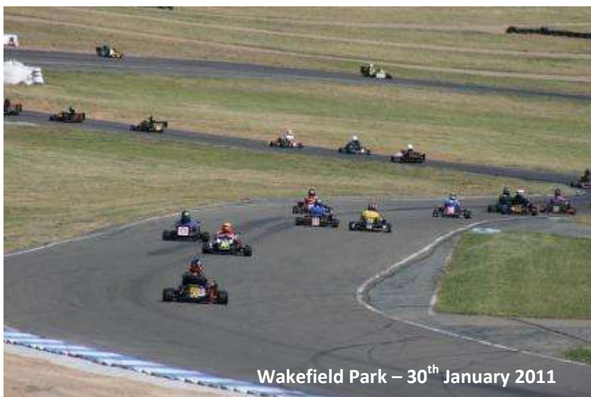
Wakefield Park – 30 th January 2011

With the AGM just around the corner in March, I remind you all that it's your right as a member if you'd like to nominate yourself for a particular position.